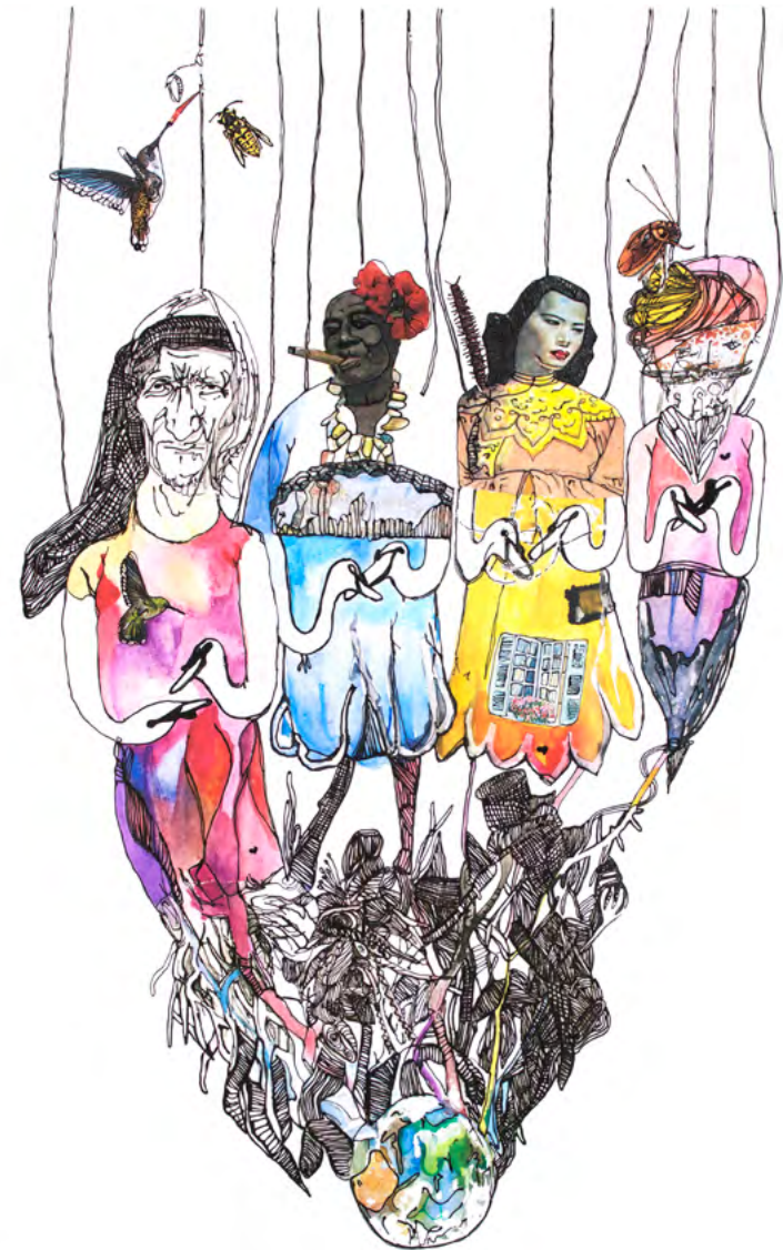
ONE WORLD ONE LOVE 2016, ACRYLIC AND MIXED MEDIA, 150CM X 100CM