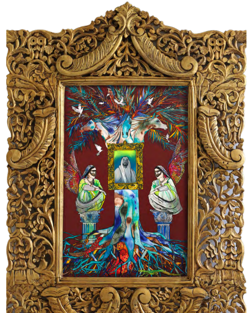
THE GUARDIANS 2017, MIXED MEDIA, 125CM X 92CM