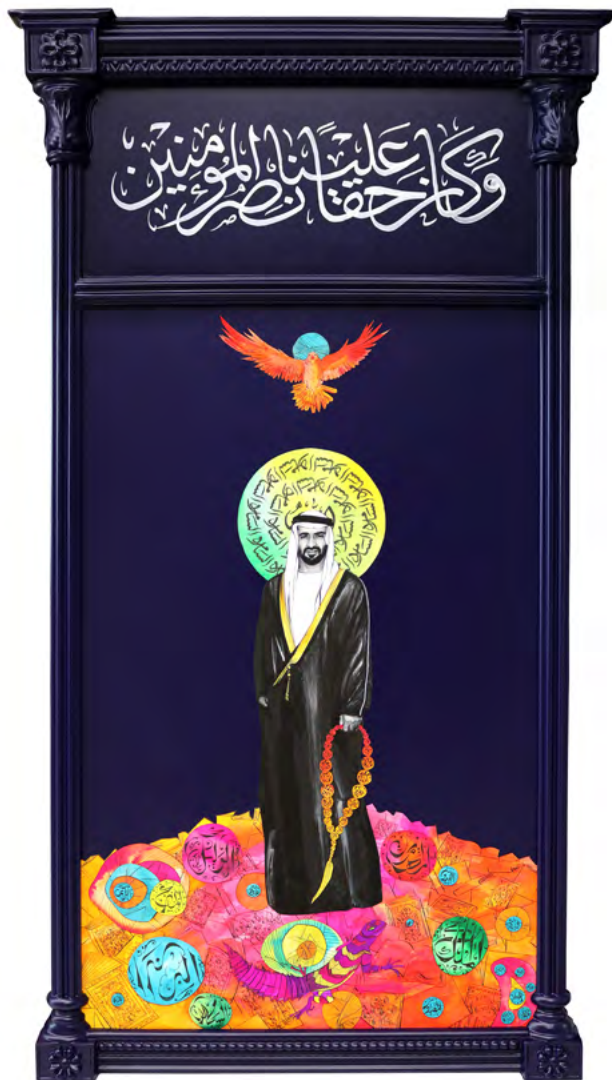
THE WISDOM III THE WISDOM IV SERIES 2018, MIXED MEDIA, 150CM X 82CM