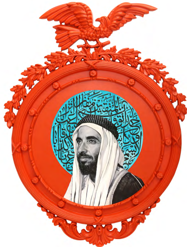
THE PRAYER II THE PRAYER SERIES 2018, MIXED MEDIA, 119CM X 89CM