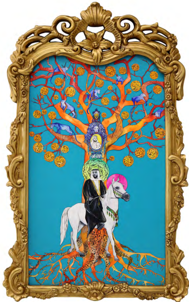
AL NOOR III AL NOOR IV SERIES 2018, MIXED MEDIA, 140CM X 82CM