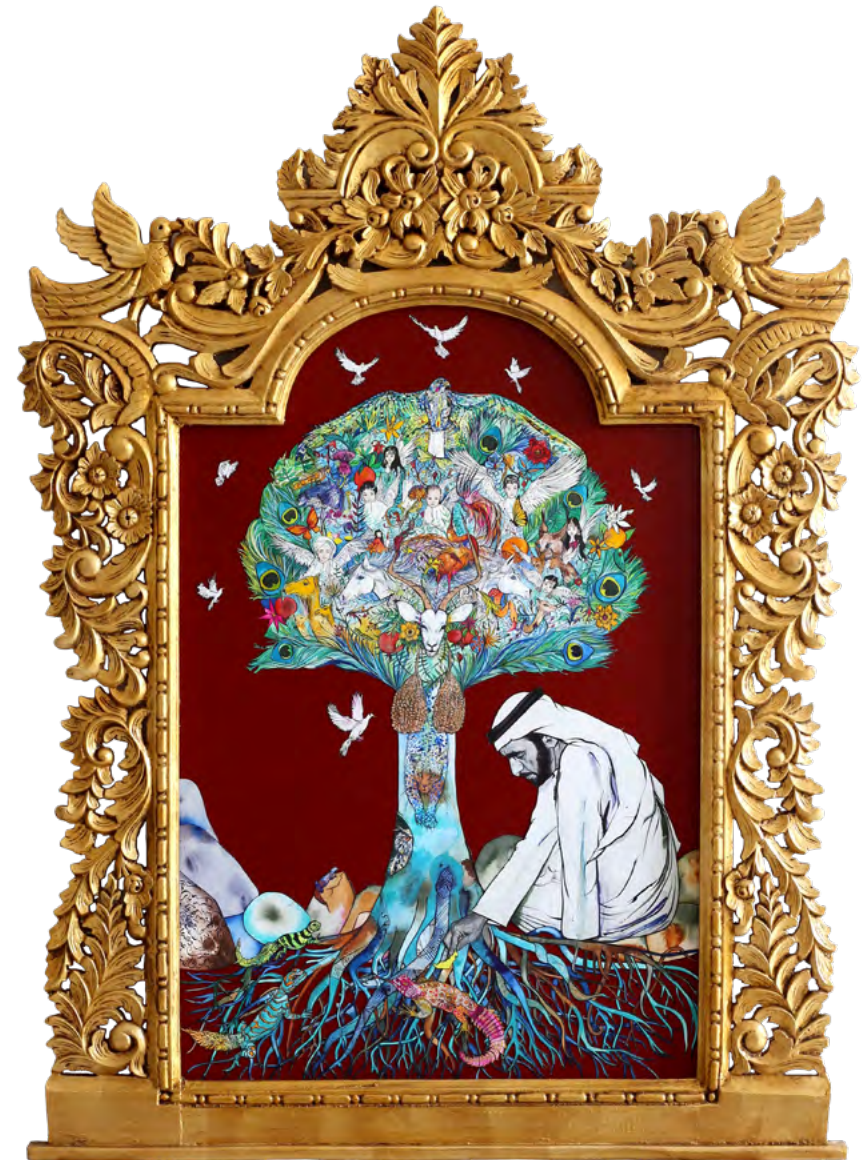
THE TREE OF LIFE 2017, MIXED MEDIA, 132CM X 97CM