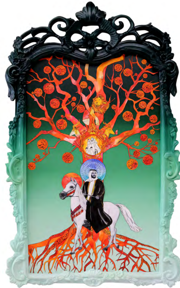
AL NOOR II AL NOOR IV SERIES 2018, MIXED MEDIA, 140CM X 82CM