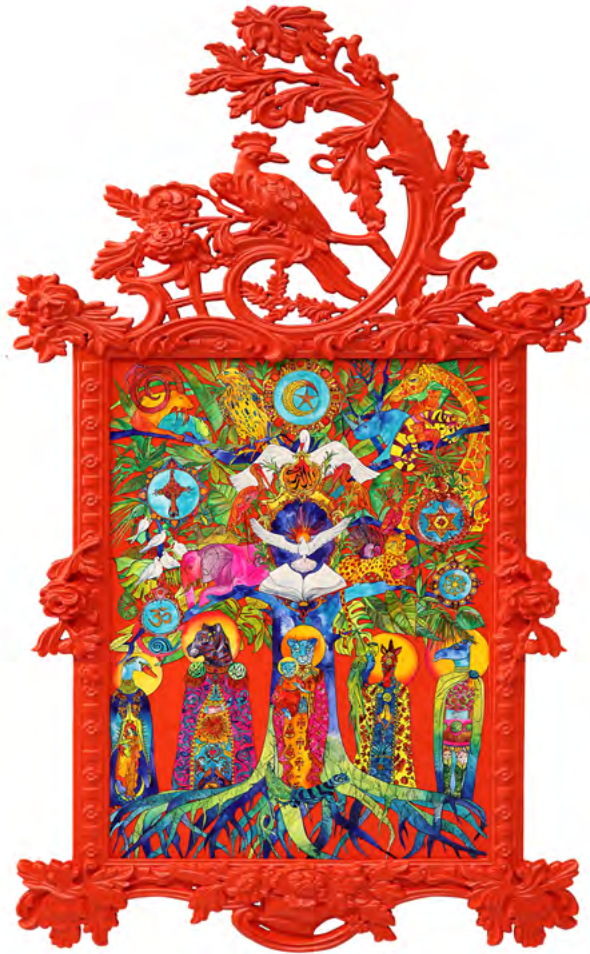
THE TREE OF AL SALAM 2018, MIXED MEDIA, 170CM X 102CM