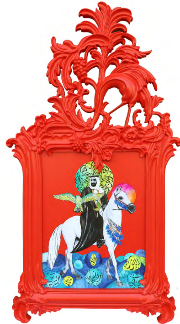
AL KHAIR 2018, MIXED MEDIA, 130CM X 70CM