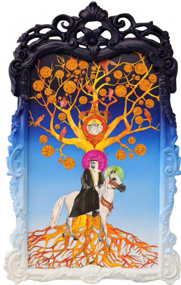
AL NOOR I AL NOOR IV SERIES 2018, MIXED MEDIA, 140CM X 82CM