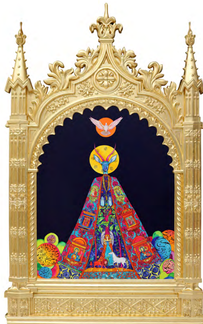
THE UNIVERSE I THE UNIVERSE III SERIES 2018, MIXED MEDIA, 170CM X 104CM