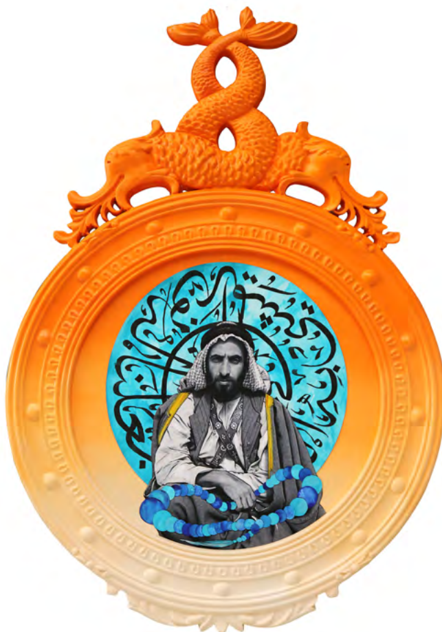
THE SOURCE OF ALL GOODNESS I THE SOURCE OF ALL GOODNESS III SERIES 2018, MIXED MEDIA, 125CM X 90CM