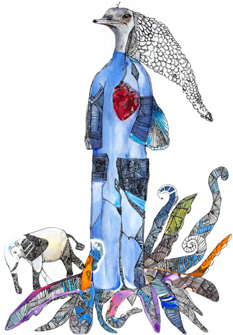
SPIRITUAL JOURNEY 2016, ACRYLIC, 160CM X 120CM