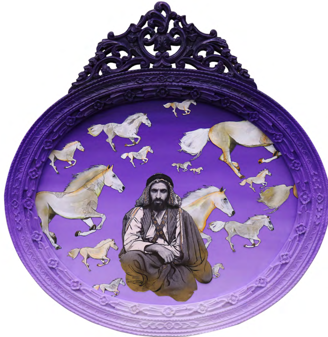
SPIRIT 2018, MIXED MEDIA, 96CM X 92 CM