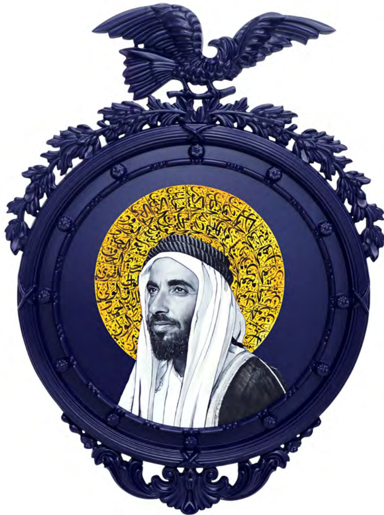
THE PRAYER I THE PRAYER SERIES 2018, MIXED MEDIA, 119CM X 89CM