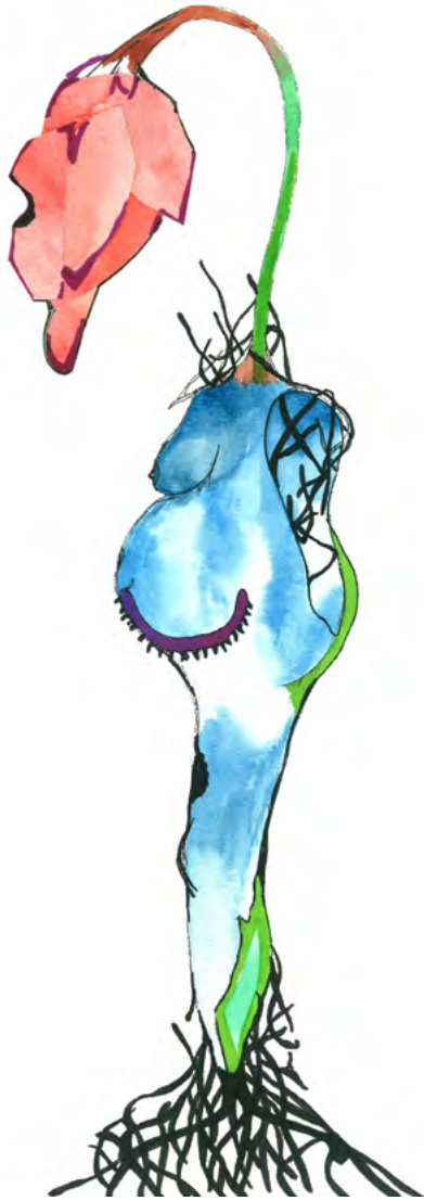
MOTHERHOOD 2016, ACRYLIC, 160CM X 60CM