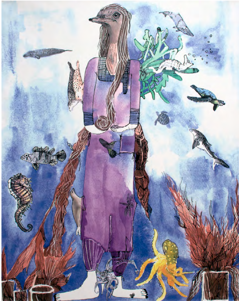
THE BEDOUIN 2012, ACRYLIC, 160CM X 120CM