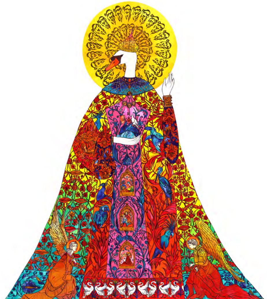
THE KEEPER OF LIGHT 2018, ACRYLIC, 200CM X 160CM