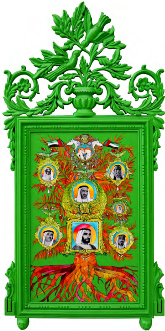
THE FOUNDING FATHERS 2018, MIXED MEDIA, 160CM X 78CM