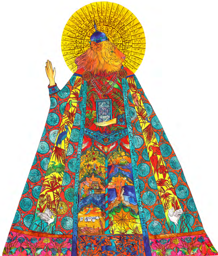
THE PROTECTOR OF LIGHT 2018, ACRYLIC, 200CM X 160CM