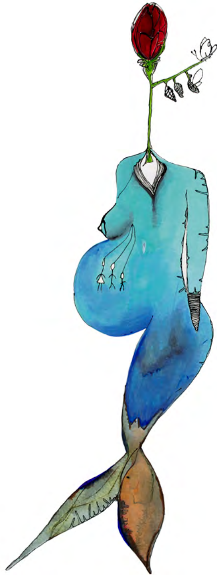
UNCONDITIONAL LOVE 2016, ACRYLIC & MIXED MEDIA, 150CM X 100CM