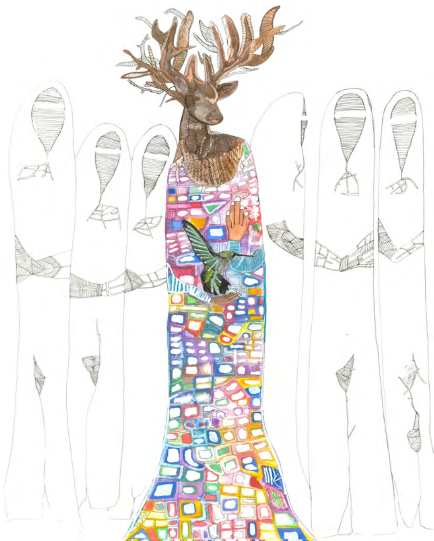
TRANSFORMATION 2016, ACRYLIC, 200CM X 160CM