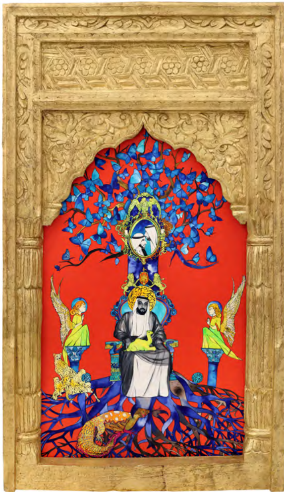
AL HADI II AL HADI III SERIES 2018, MIXED MEDIA, 123CM X 72CM