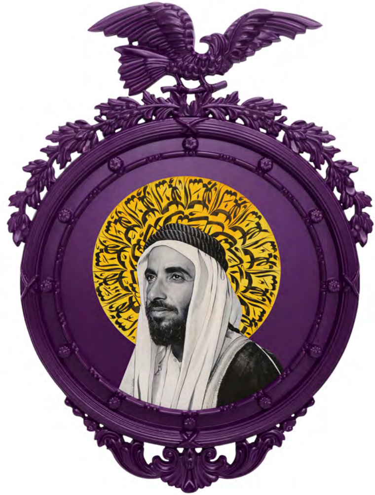
THE PRAYER VI THE PRAYER SERIES 2018, MIXED MEDIA, 119CM X 89CM