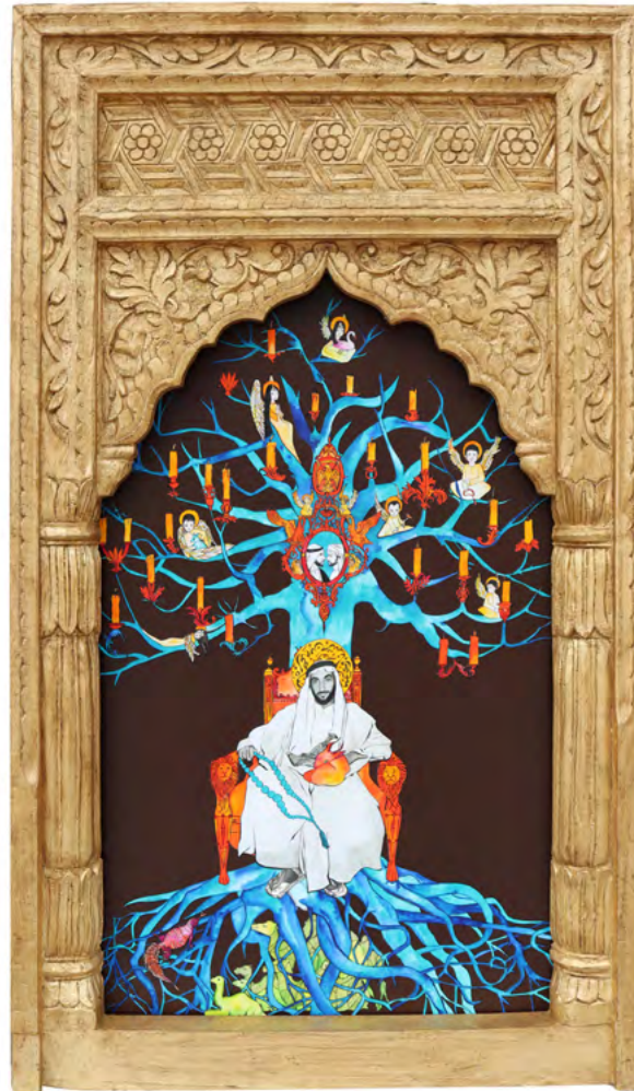
AL HADI I AL HADI III SERIES 2018, MIXED MEDIA, 123CM X 72CM