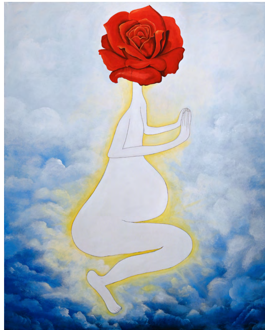
THE MOTHER OF UNCONDITIONAL LOVE 2022, ACRYLIC, 200CM X 160CM