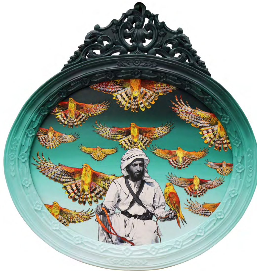
THE VISIONARY 2018, MIXED MEDIA, 97CM X 89CM