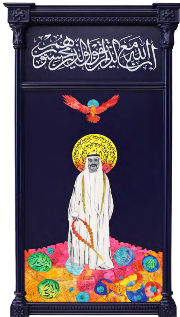
THE WISDOM IV THE WISDOM IV SERIES 2018, MIXED MEDIA, 150CM X 82CM