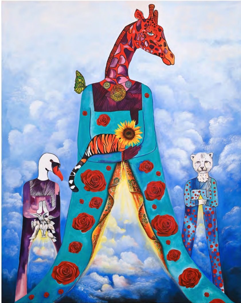
THE MOTHER OF PROTECTION 2022, ACRYLIC, 200CM X 160CM