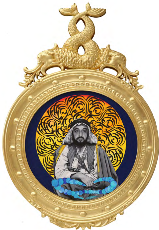
THE SOURCE OF ALL GOODNESS II THE SOURCE OF ALL GOODNESS III SERIES 2018, MIXED MEDIA, 125CM X 90CM