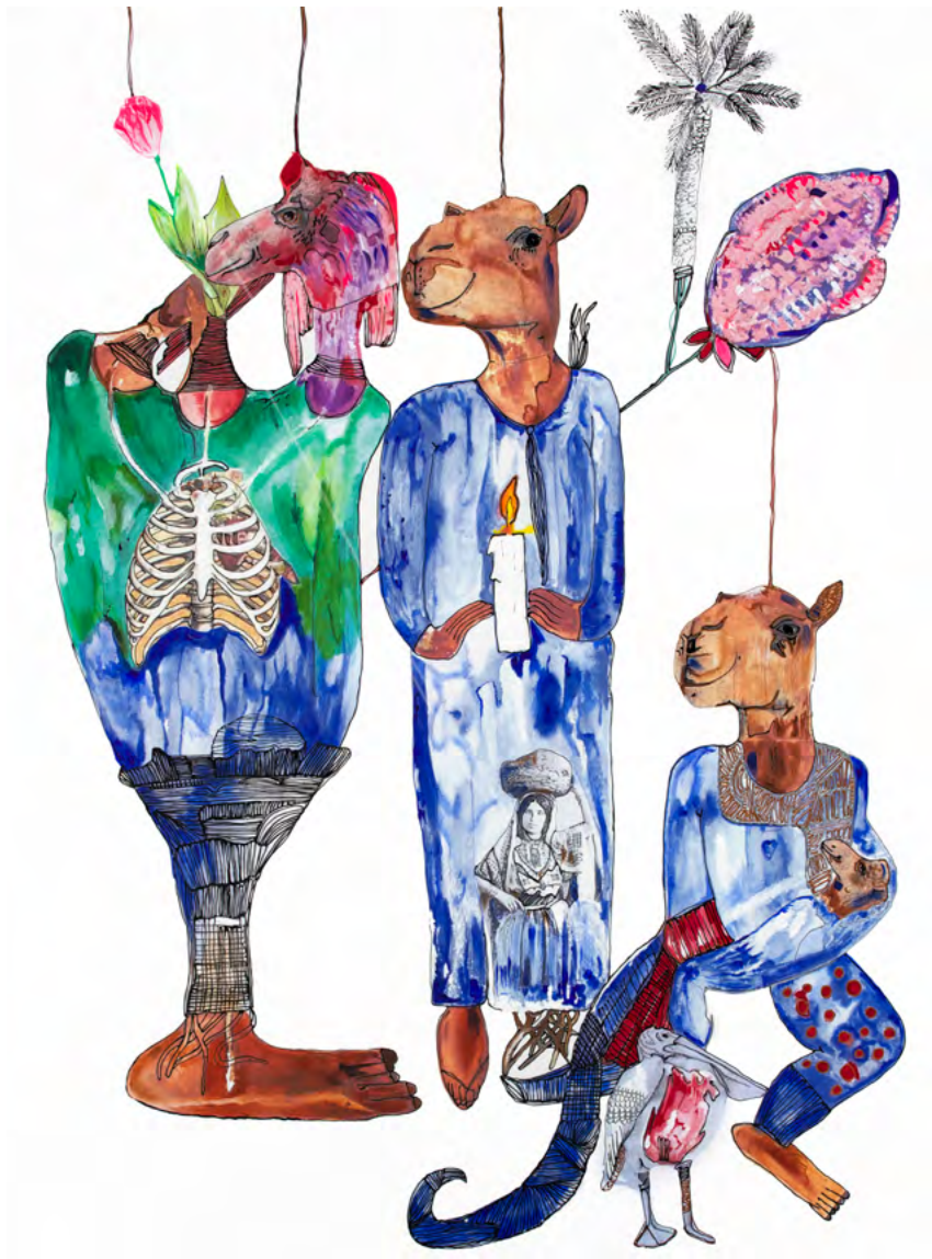
THE BEDOUIN FAMILY 2016, ACRYLIC AND MIXED MEDIA, 160CM X 120CM