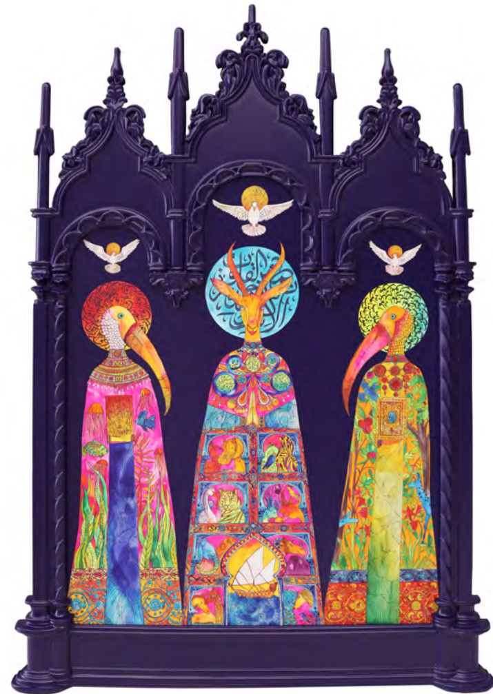
THE ARCH OF FAITH 2018, MIXED MEDIA, 151CM X 97CM