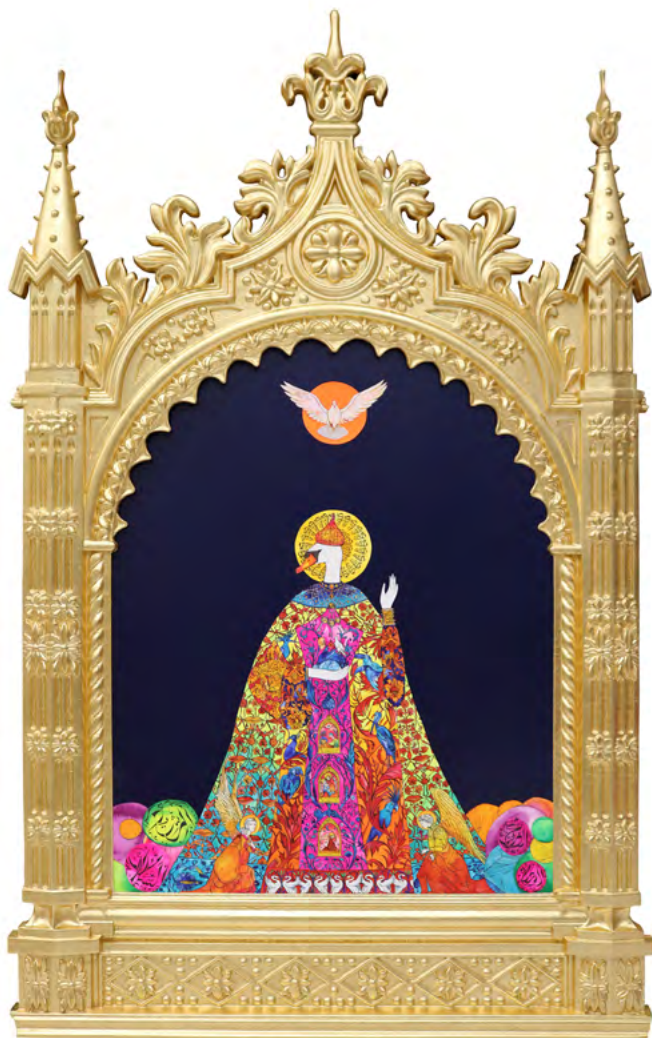
THE UNIVERSE II THE UNIVERSE III SERIES 2018, MIXED MEDIA, 170CM X 104CM