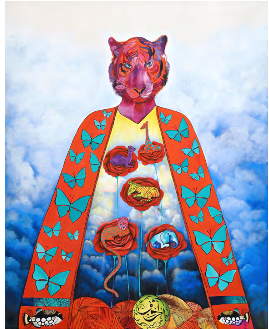
THE MOTHER OF ENLIGHTENMENT 2022, ACRYLIC, 200CM X 160CM