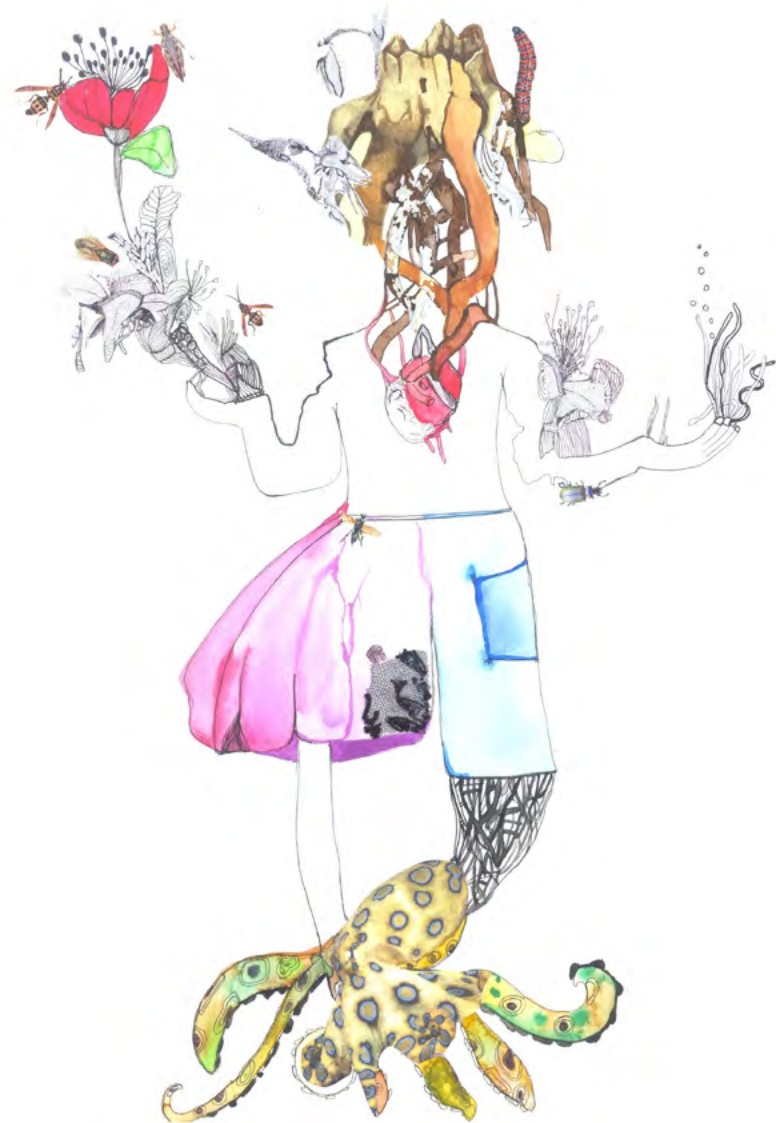
GENDER EQUALITY 2016, ACRYLIC AND MIXED MEDIA, 140CM X 100CM