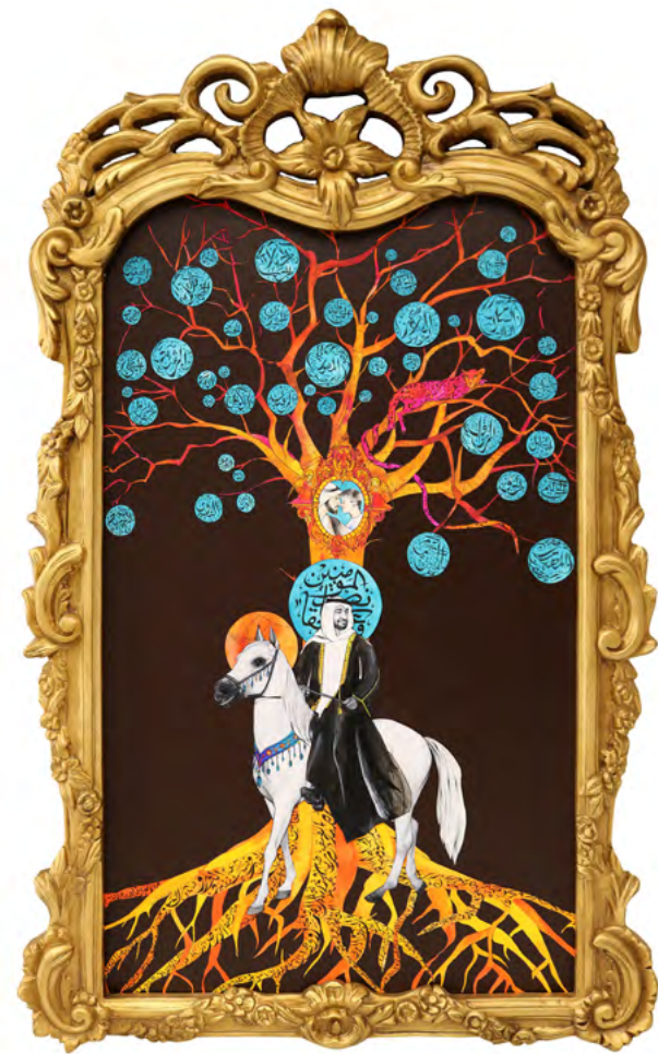
AL NOOR III AL NOOR IV SERIES 2018, MIXED MEDIA, 140CM X 82CM