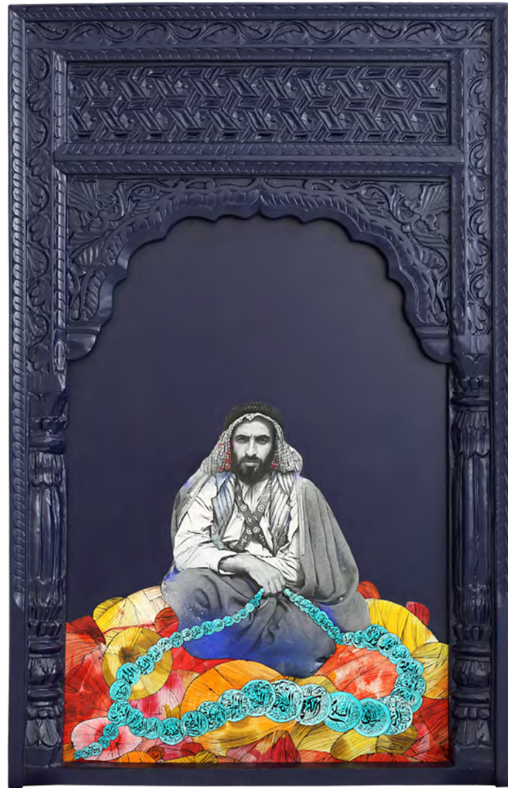
THE PRAYER 2017, MIXED MEDIA, 128CM X 80.5CM