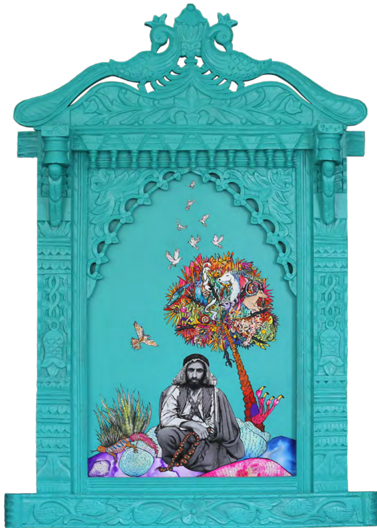
SIR BANI YAS 2017, MIXED MEDIA, 151.5CM X 107.5CM