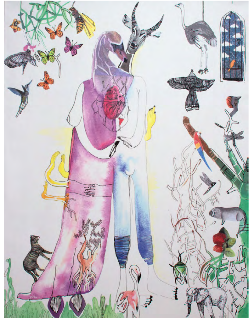
THE SPIRITUAL HEALER 2012, ACRYLIC, 160CM X 120CM