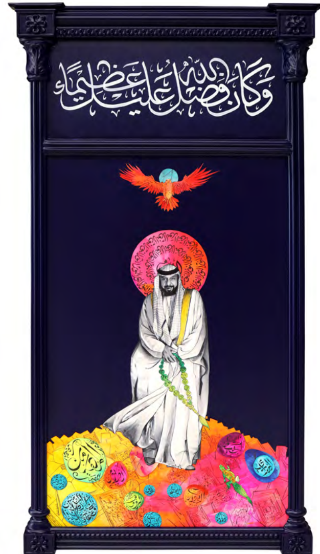
THE WISDOM II THE WISDOM IV SERIES 2018, MIXED MEDIA, 150CM X 82CM