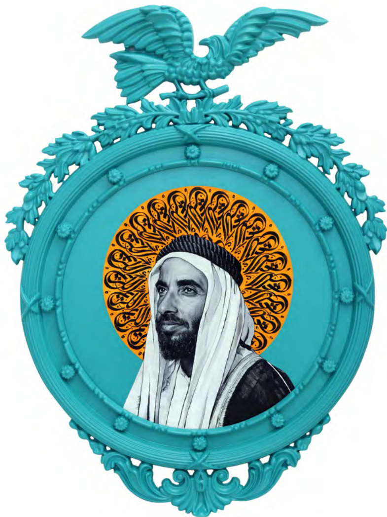
THE PRAYER III THE PRAYER SERIES 2018, MIXED MEDIA, 119CM X 89CM