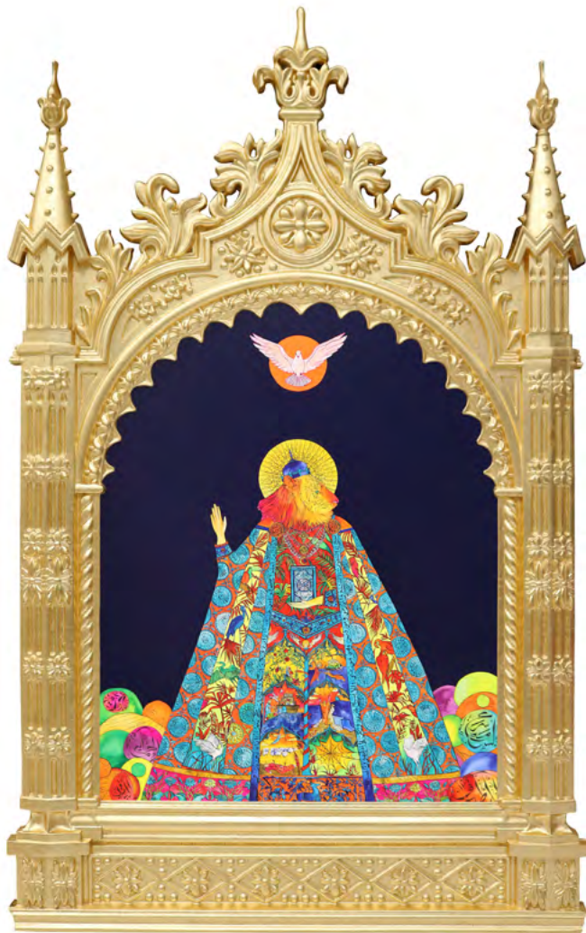
THE UNIVERSE III THE UNIVERSE III SERIES 2018, MIXED MEDIA, 170CM X 104CM