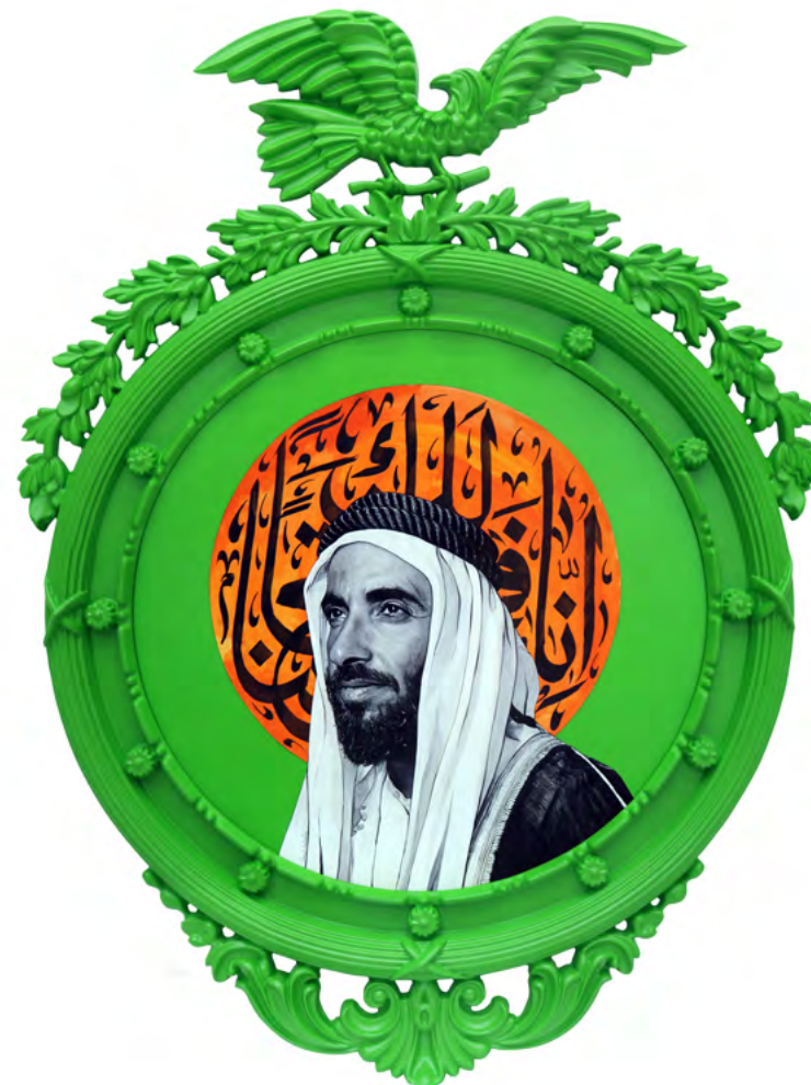
THE PRAYER IV THE PRAYER SERIES 2018, MIXED MEDIA, 119CM X 89CM