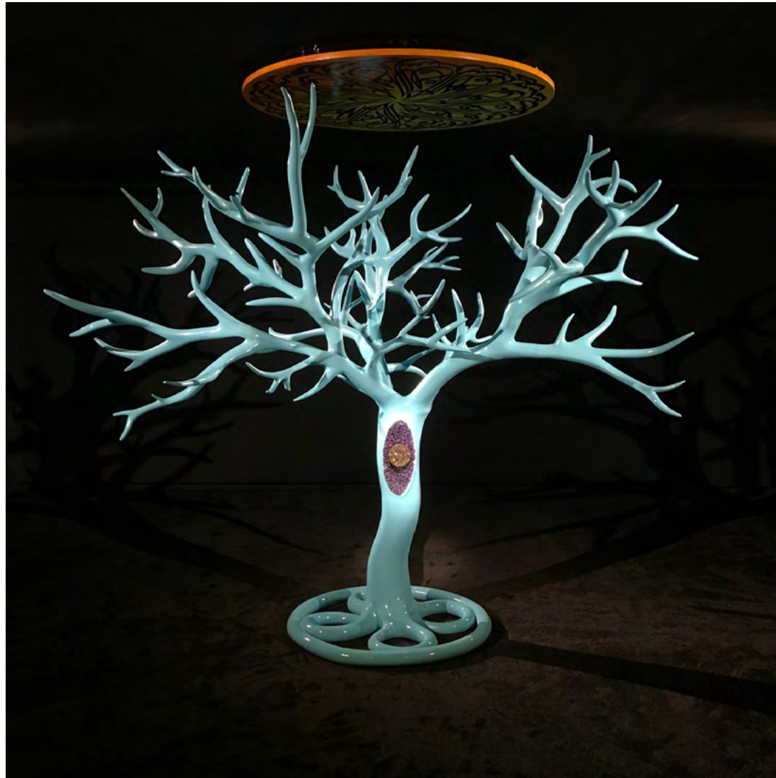
THE ETERNAL GUIDE 2022, SCULPTURE, 2.6M HEIGHT X 3M WIDTH