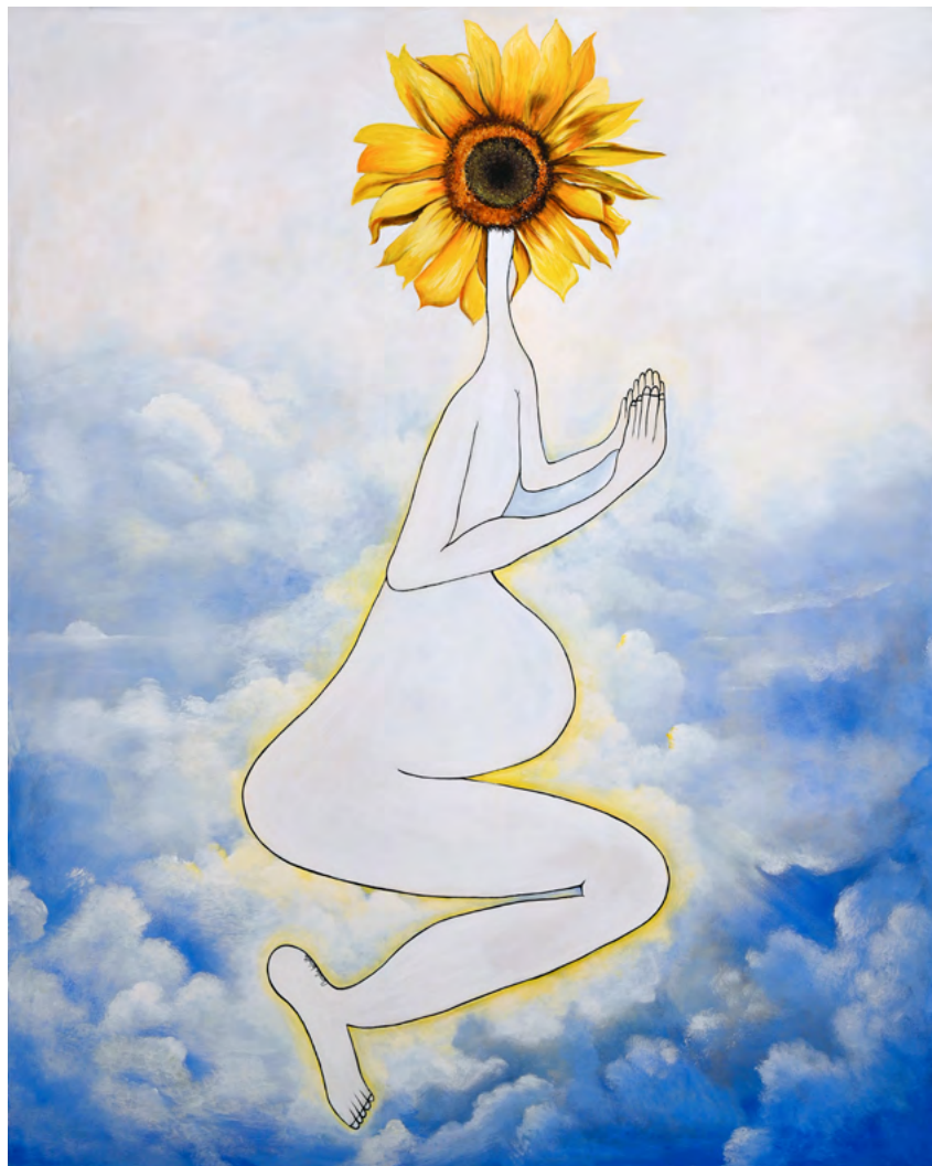
THE MOTHER OF PRAYER 2022, ACRYLIC, 200CM X 160CM