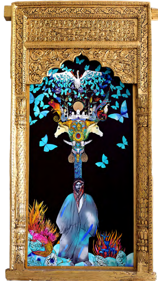
UNITY 2017, MIXED MEDIA, 184CM X 105CM