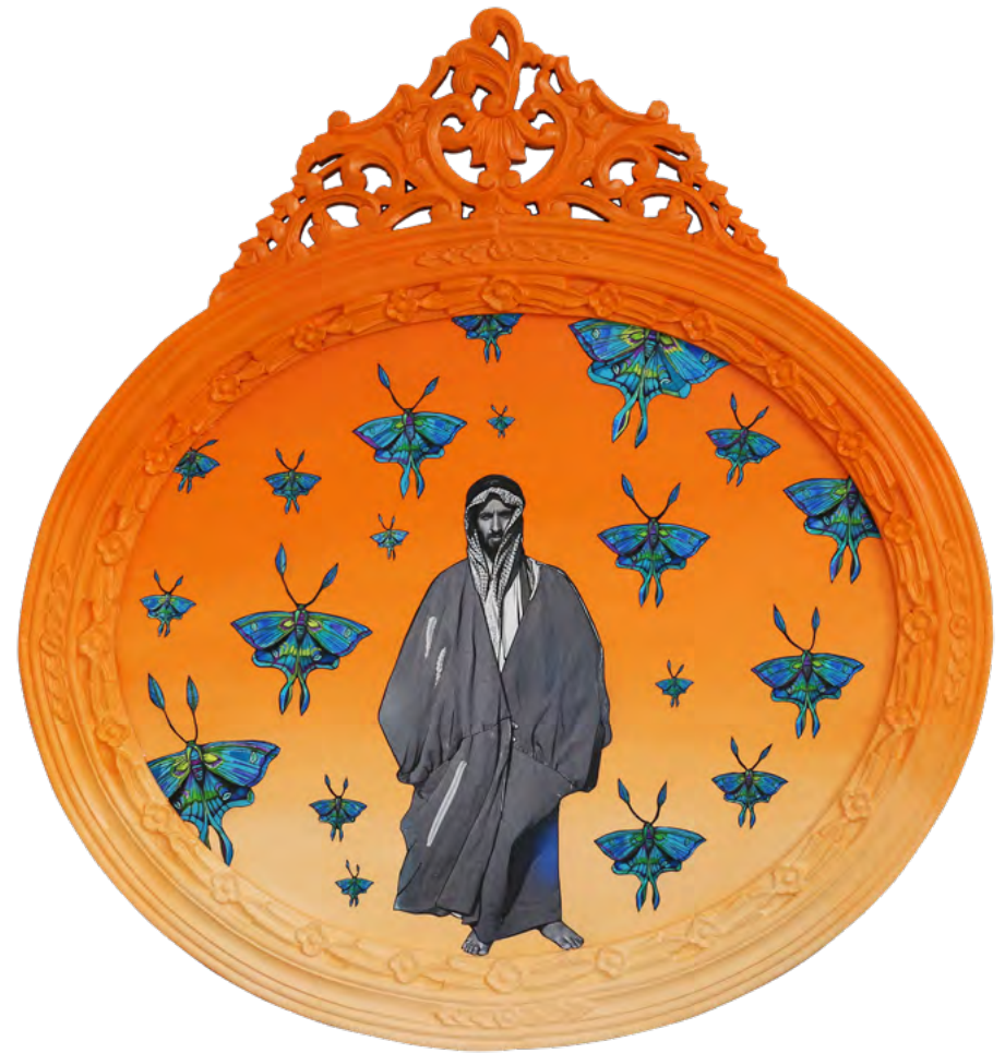
FREEDOM 2017, MIXED MEDIA, 97CM X 89CM