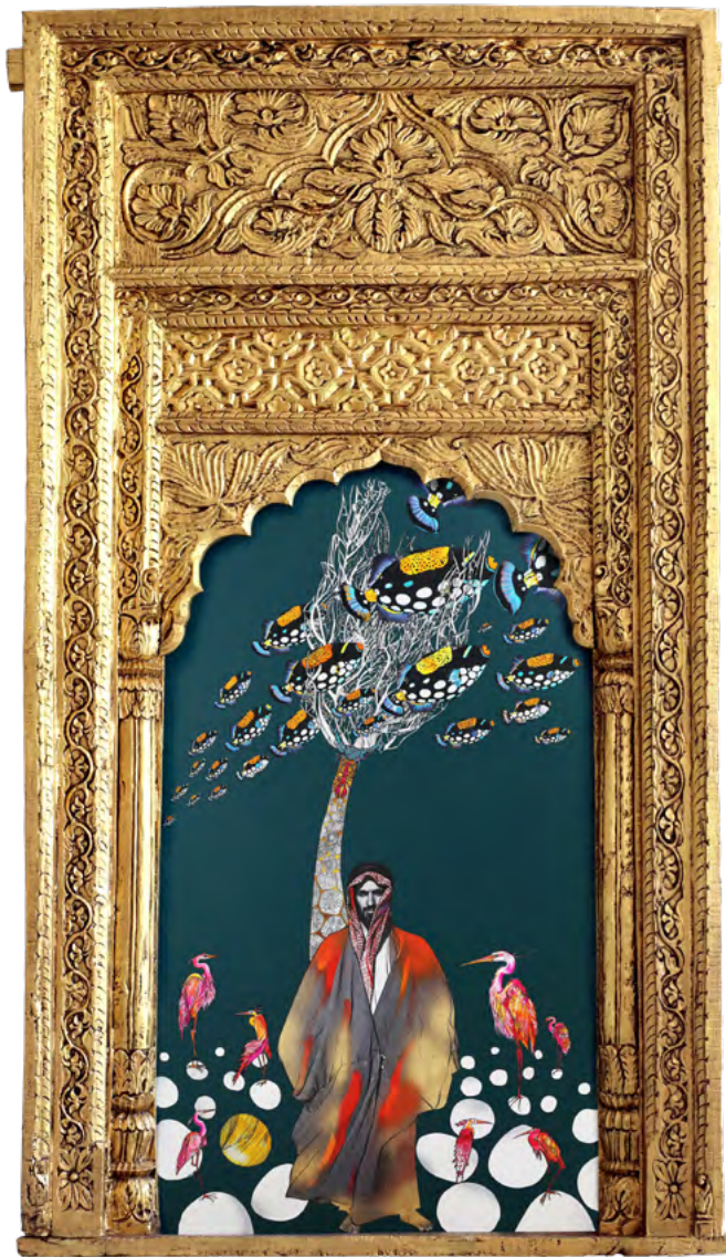
PROSPERITY 2017, MIXED MEDIA, 193CM X 105CM