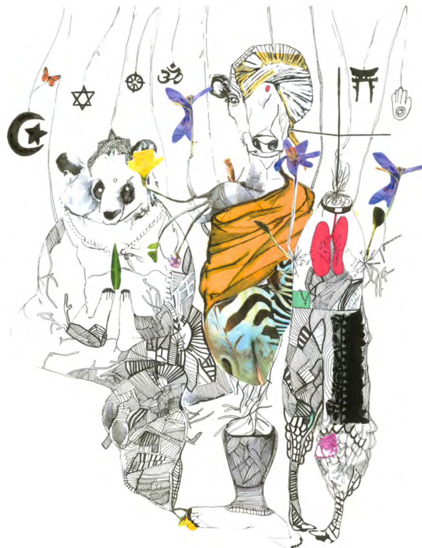
RELIGIONS UNITED 2016, ACRYLIC, 200CM X 160CM