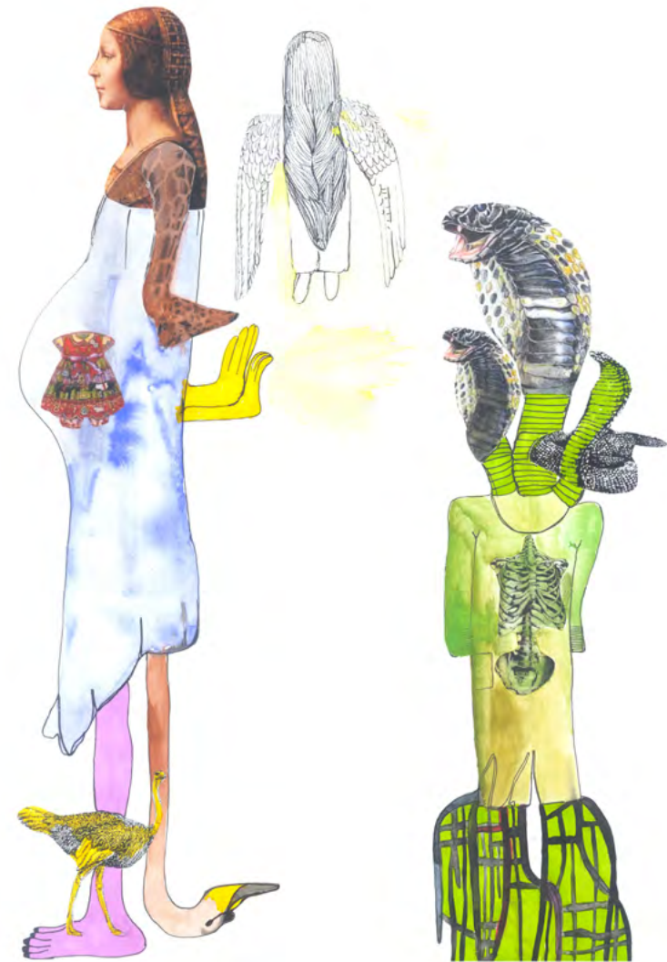
THE HEALER 2016, ACRYLIC, 160CM X 120CM