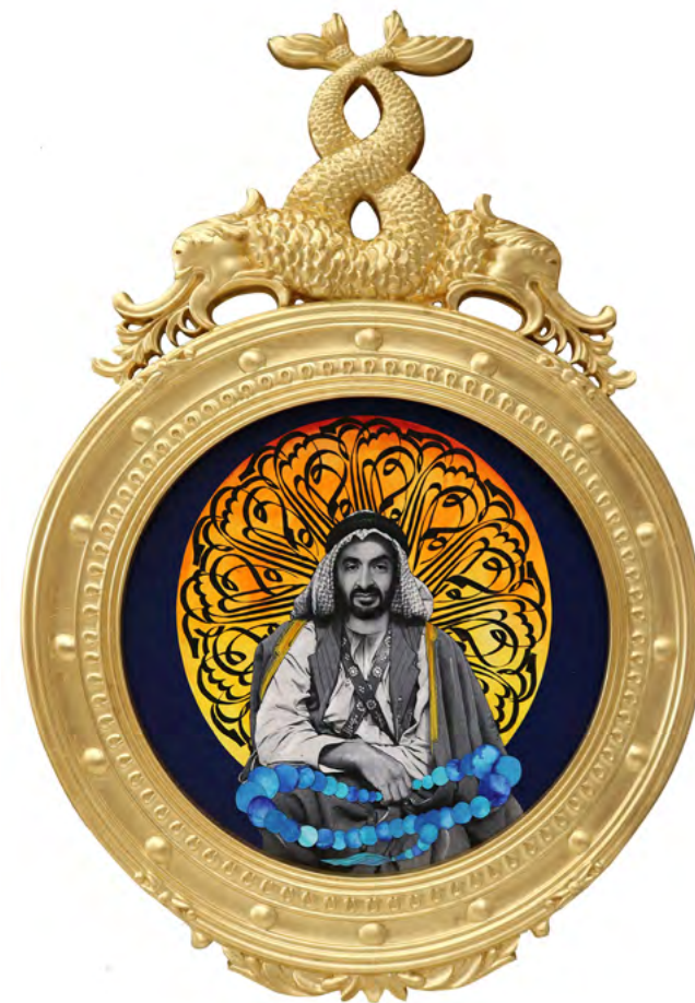
THE SOURCE OF ALL GOODNESS III THE SOURCE OF ALL GOODNESS III SERIES 2018, MIXED MEDIA, 125CM X 90CM