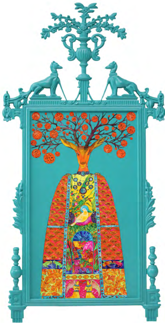
THE MESSENGER 2018, MIXED MEDIA, 215CM X 105CM