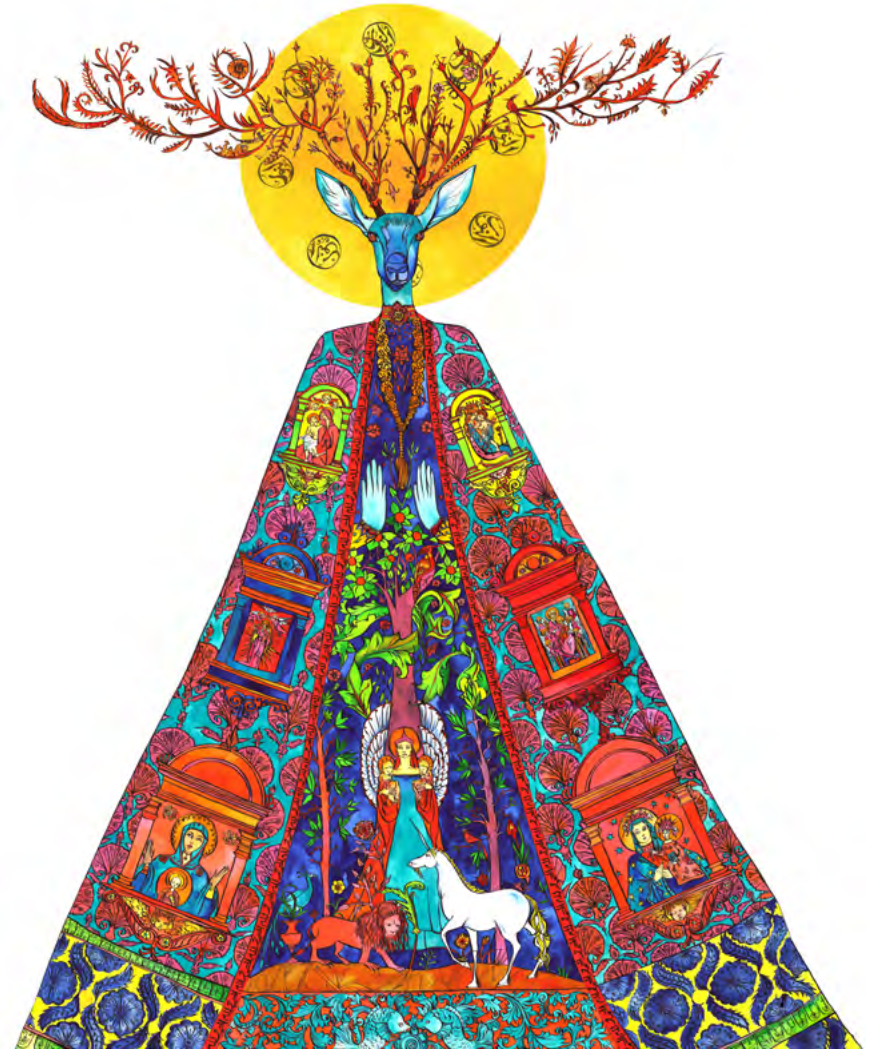
THE AWAKENING 2018, ACRYLIC, 200CM X 160CM