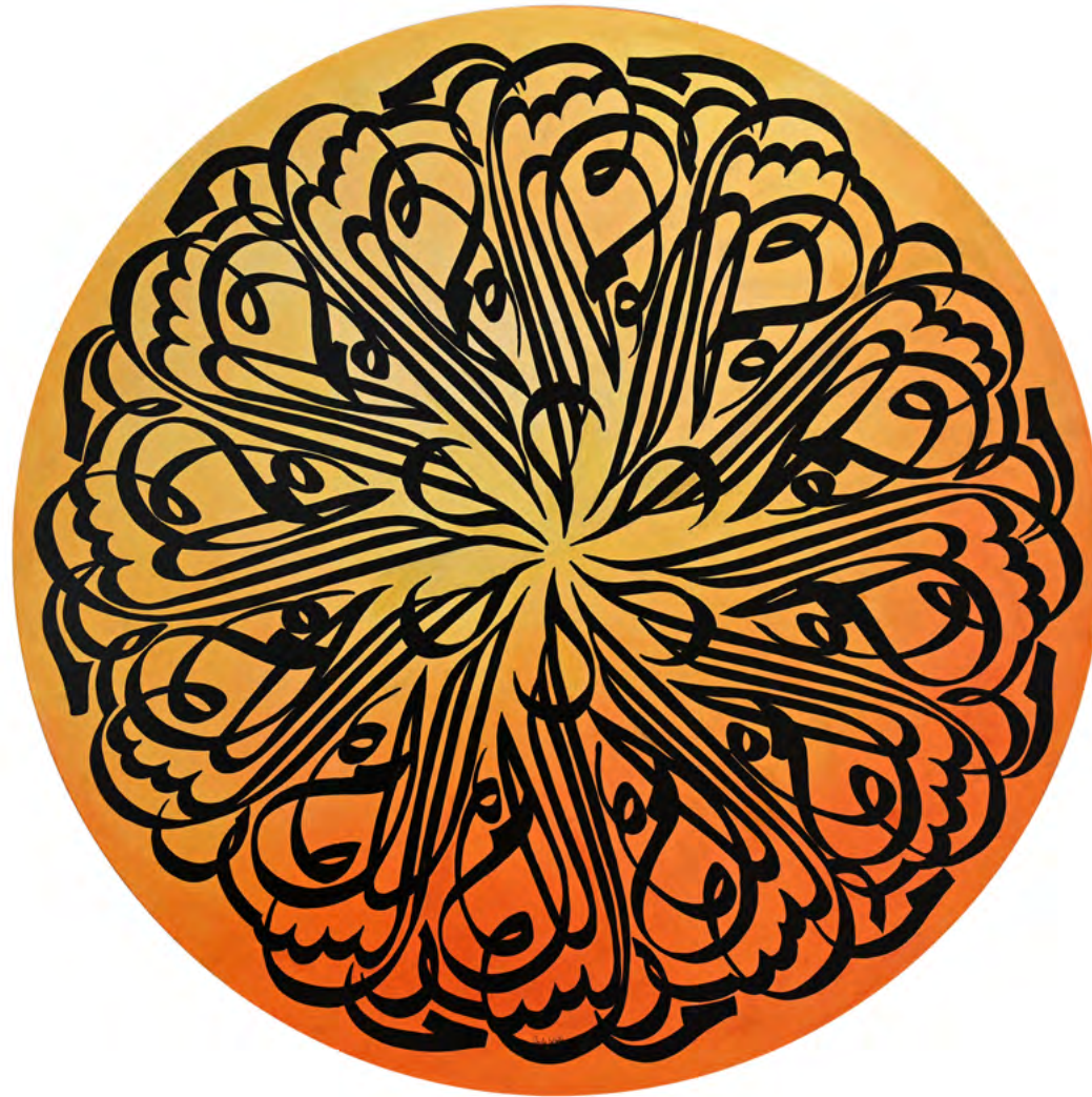
THE DIVINE PROTECTION 2022, ACRYLIC, 1.5M DIA.