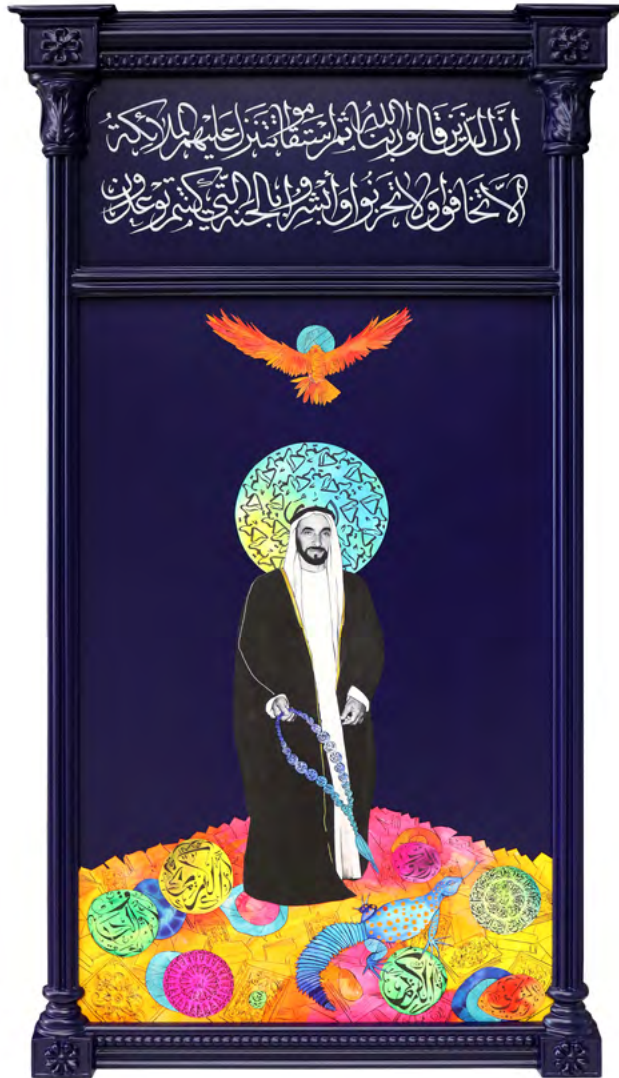
THE WISDOM I THE WISDOM IV SERIES 2018, MIXED MEDIA, 150CM X 82CM