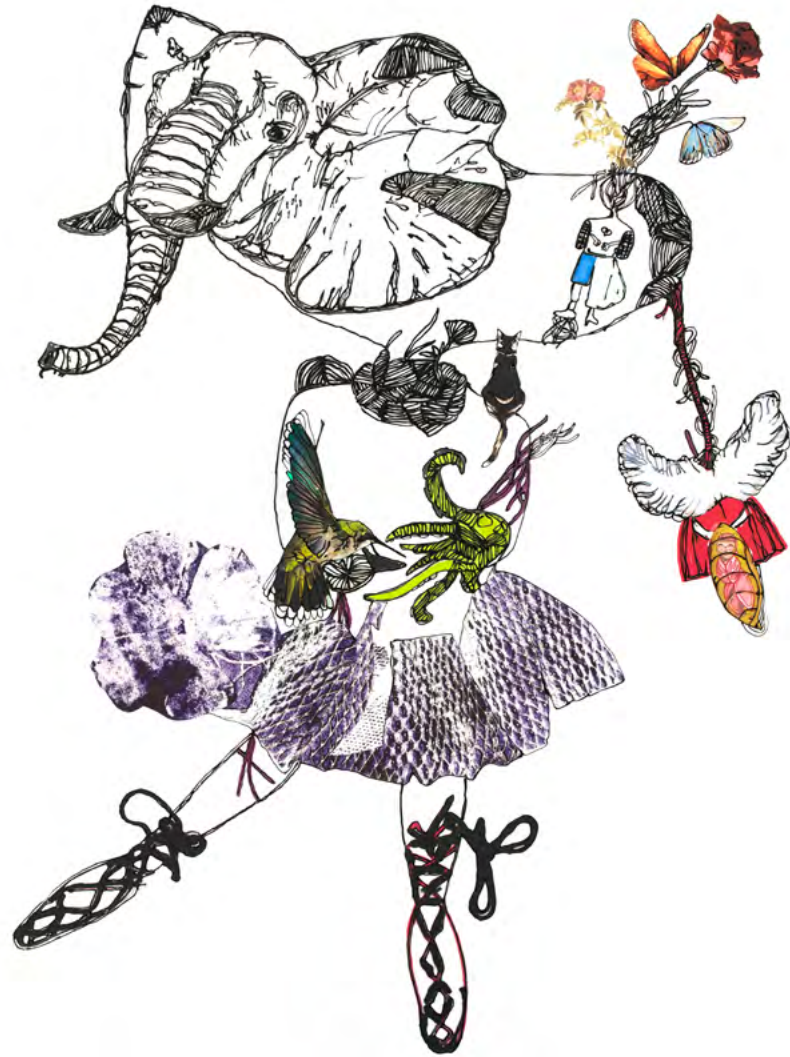
THE DANCER 2016, ACRYLIC AND MIXED MEDIA, 125CM X 100CM