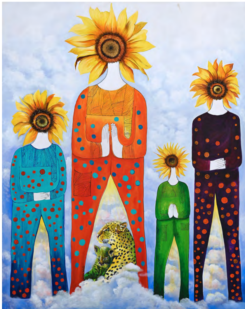
THE MOTHER OF FAMILY 2022, ACRYLIC, 161CM X 120CM