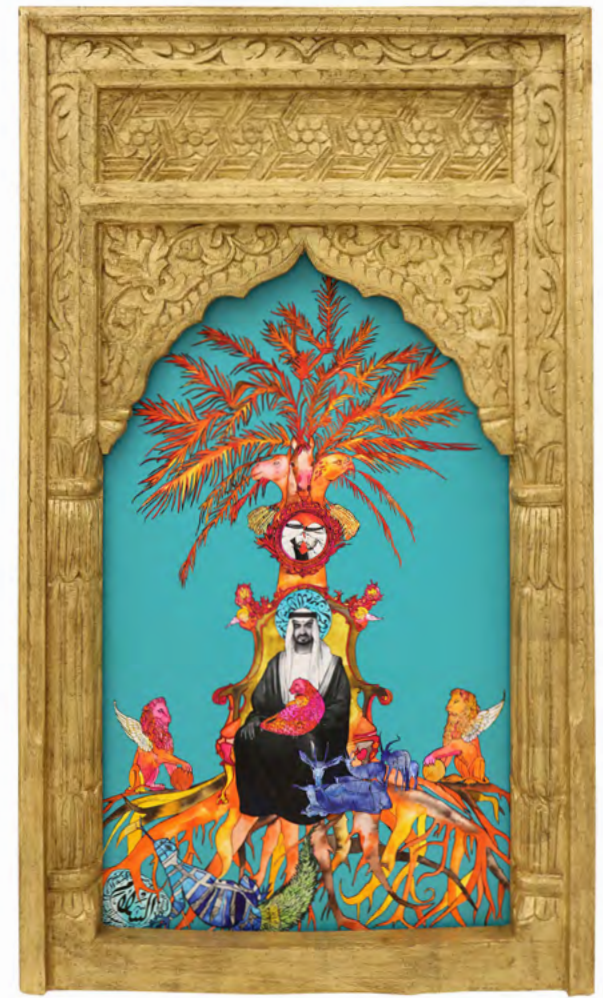
AL HADI III AL HADI III SERIES 2018, MIXED MEDIA, 123CM X 72CM