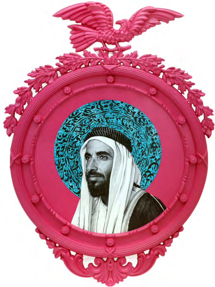
THE PRAYER V THE PRAYER SERIES 2018, MIXED MEDIA, 119CM X 89CM