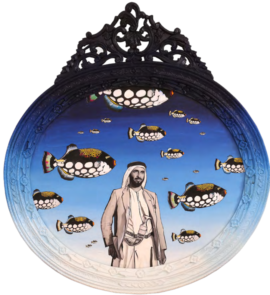
THE TRIBE 2017, MIXED MEDIA, 97CM X 89CM