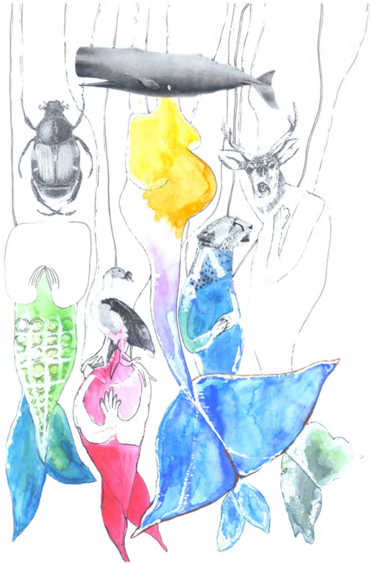
CHILDREN OF THE EARTH 2016, ACRYLIC, 200CM X 160CM