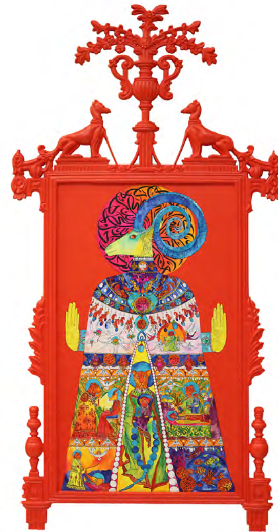
THE MIRACLES 2018, MIXED MEDIA, 215CM X 105CM