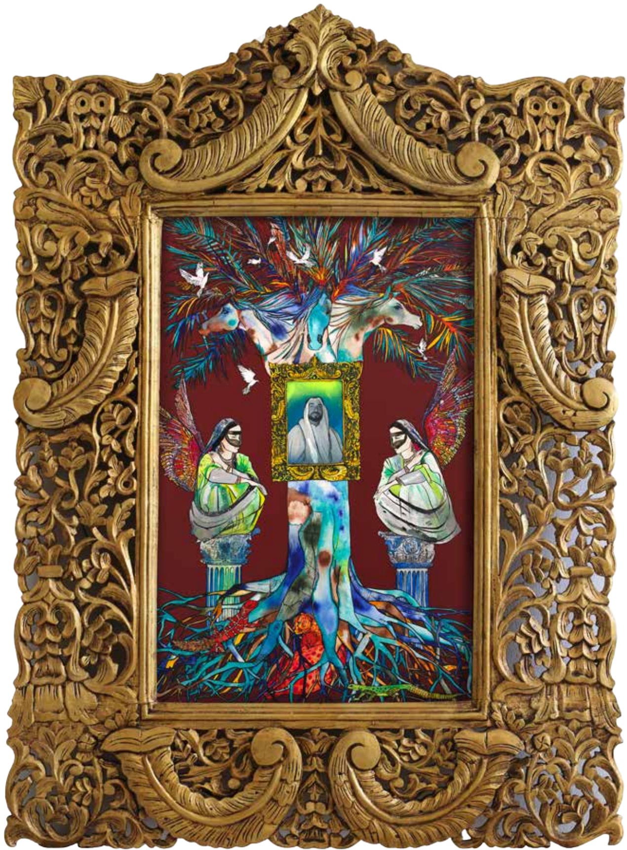
THE GUARDIANS 2017, MIXED MEDIA, 125CM X 92CM