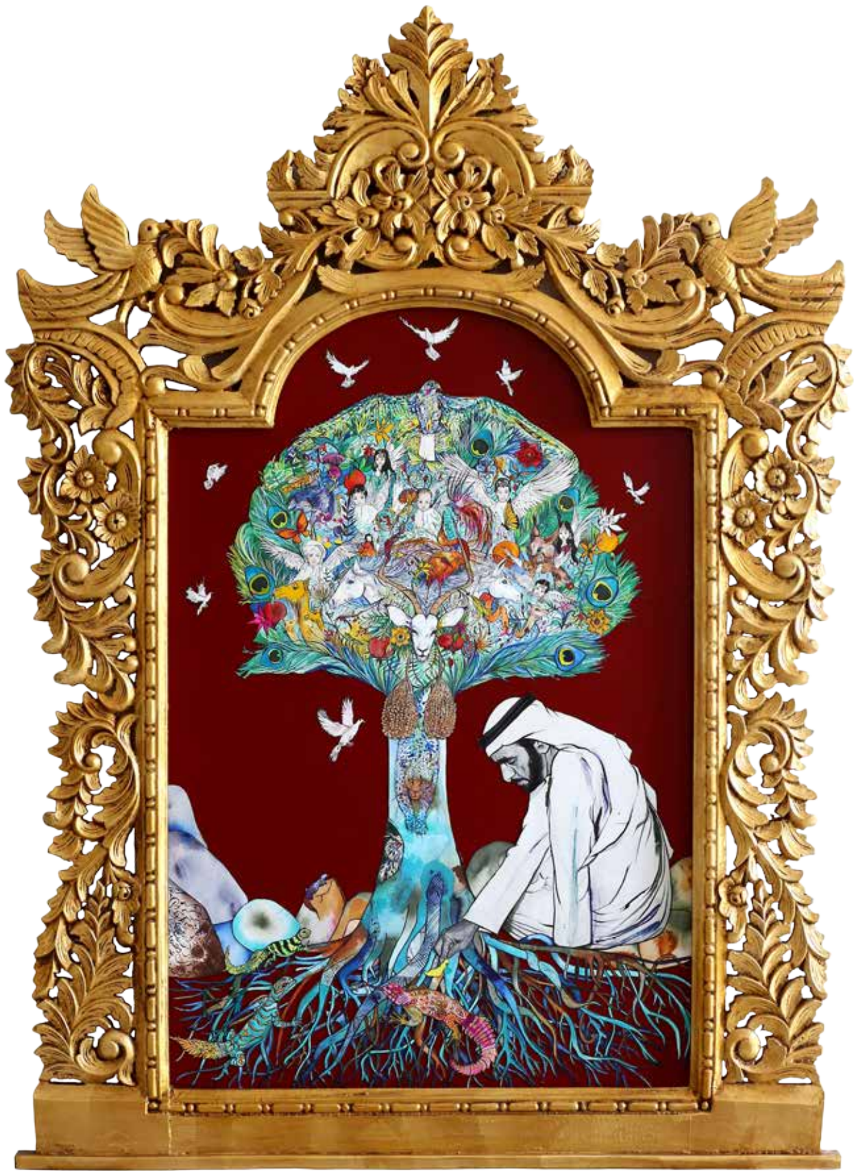
THE TREE OF LIFE 2017, MIXED MEDIA, 132CM X 97CM