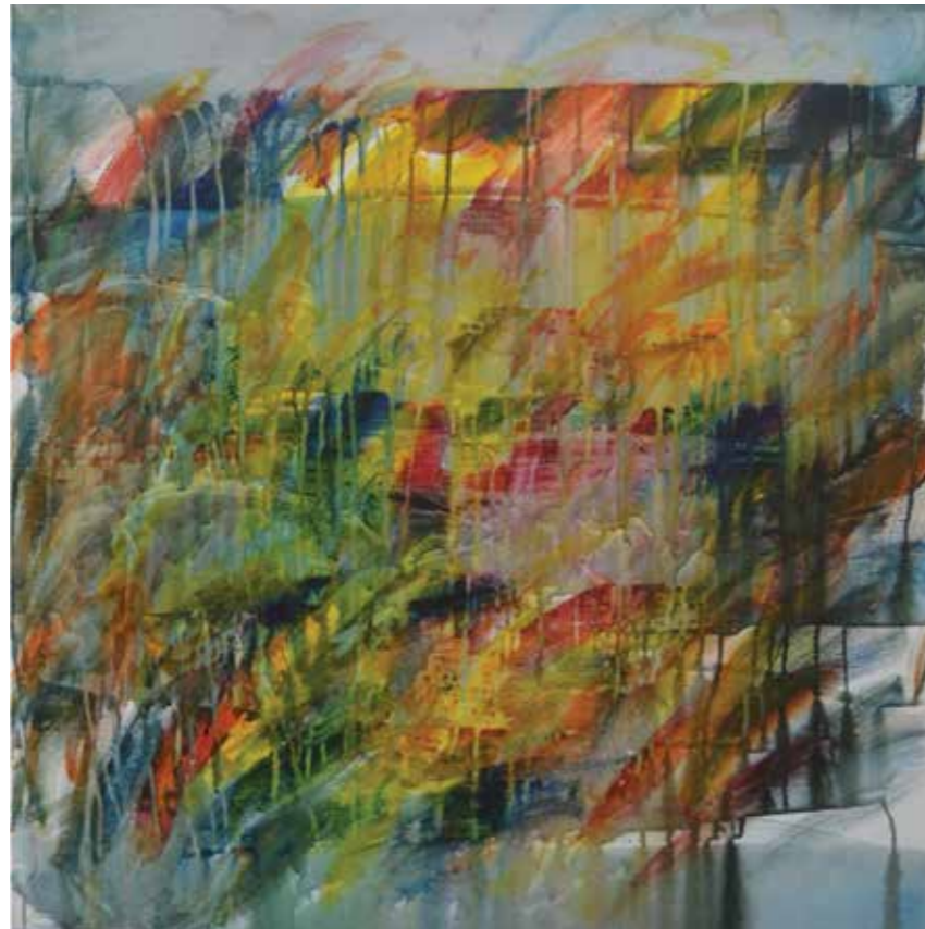
Abdul Rahim Salim, Composition I, (80 x 80) 2017