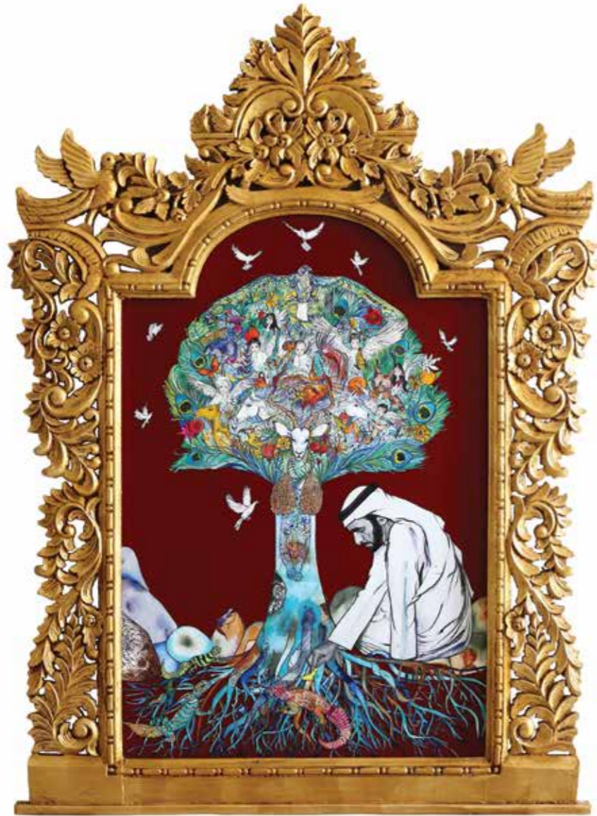
Amalie Beljafla, The Tree Of life, Mixed Media, (132 x 97) 2017