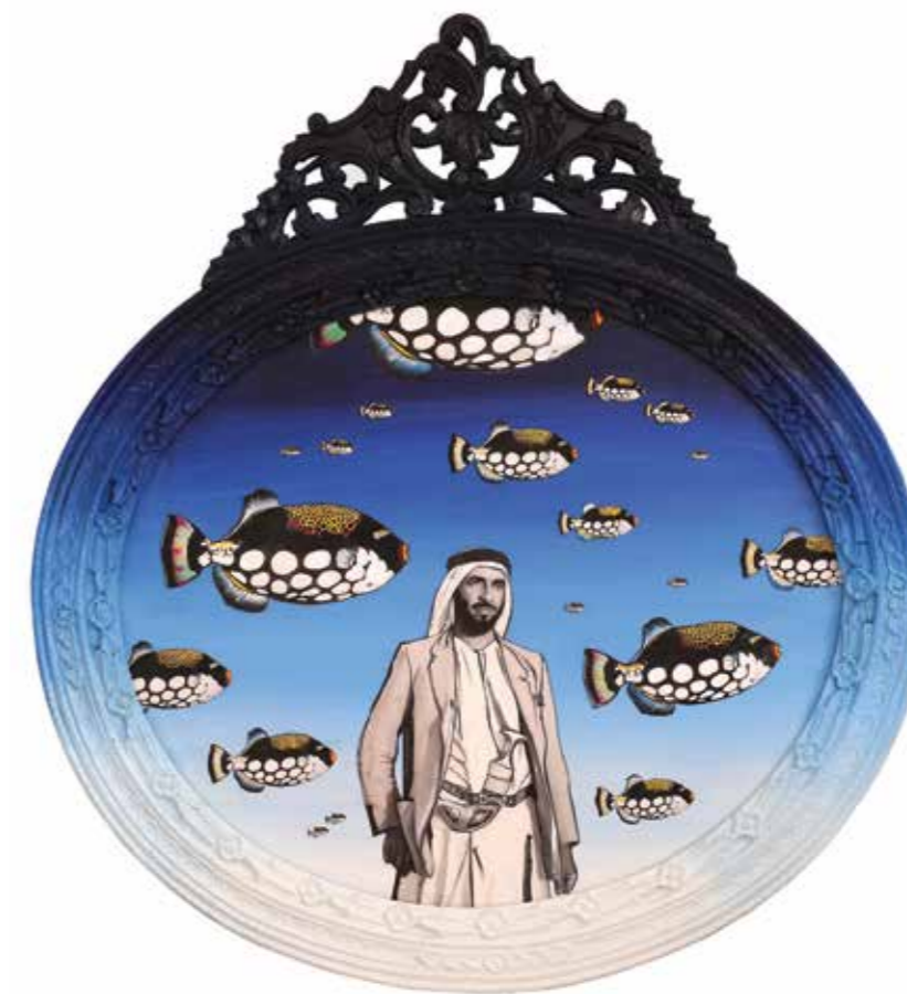
Amalie Beljafla, The Tribe, 2017, Mixed Media, (97 x 89) 2017