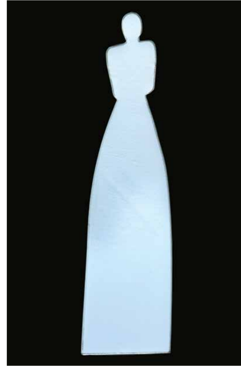
Makki Sculpture, Crystal Caviar, MOON, 2017