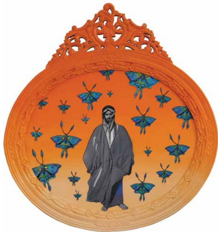
Amalie Beljafla, Freedom, 2017, Mixed Media, (97 x 89) 2017