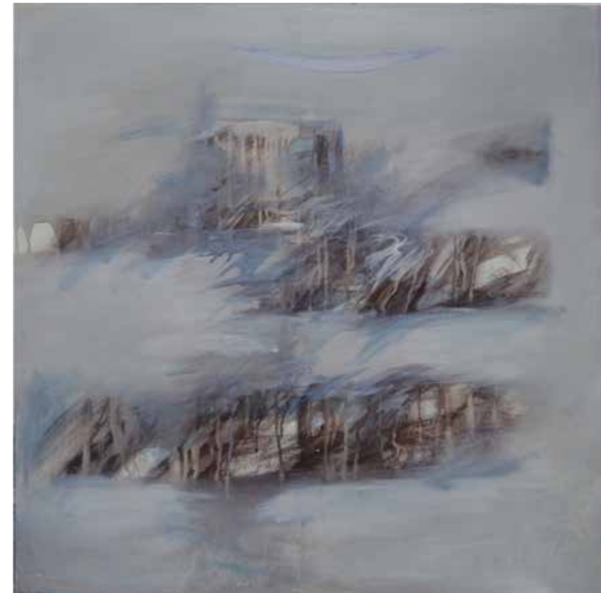
Abdul Rahim Salim, Composition II, (80 x 80) 2017