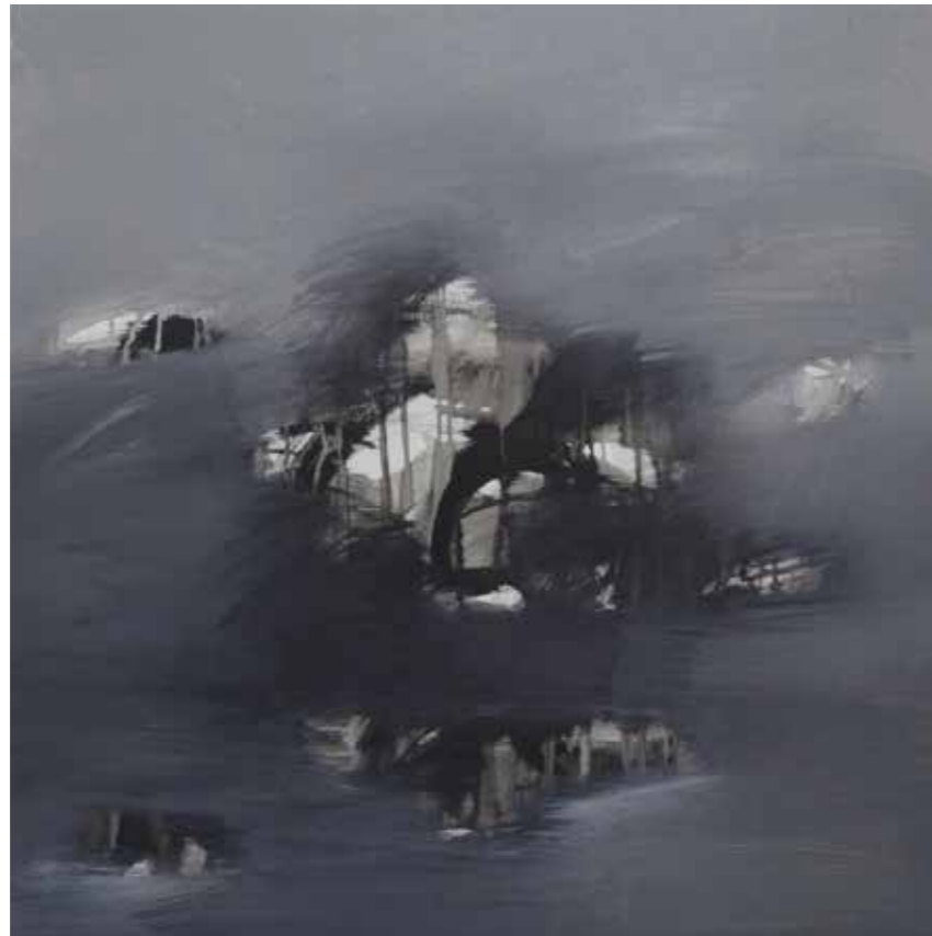
Abdul Rahim Salim, Composition V, (80 x 80) 2017