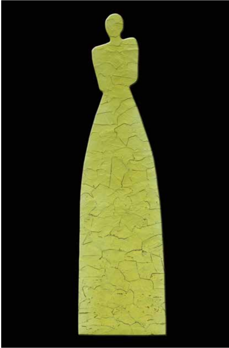
Makki Sculpture, Crystal Caviar, SUN, 2017